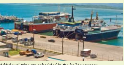
Additional trips are scheduled in the holiday season.

islands and Suva harbour cruises have been scheduled, and fishing vessels coming in to refuel and re-provision will also use the Muaiwalu facilities.