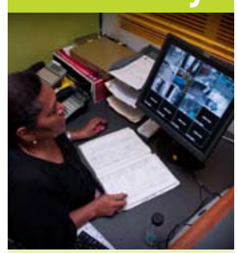
The CCTV system allows monitoring of all departments and entrances.

WITH the installation of twenty-four closed circuit television cameras Fiji Ships & Heavy Industries Litd (FSHIL) has tightened the company's security measures.