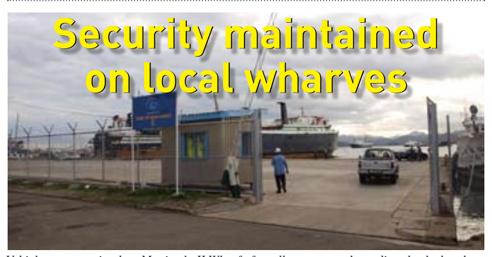
Vehicles are permitted on Muaiwalu II Wharf after all passengers have disembarked and collected their luggage.

The steering committee is organising their own departmental meetings, and ensuring that all projects will be completed by the end of June.