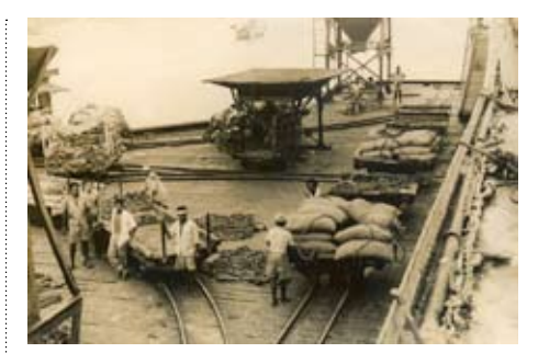
Sacks of sugar were pushed by hand on rail carts to the ship's side.

carts into nets in loads of about two tons at a time, before being slung on board and unloaded onto grilles above the ship's open hatch. The sacks were then split open, and the contents emptied into the hold, where gangs of workers worked