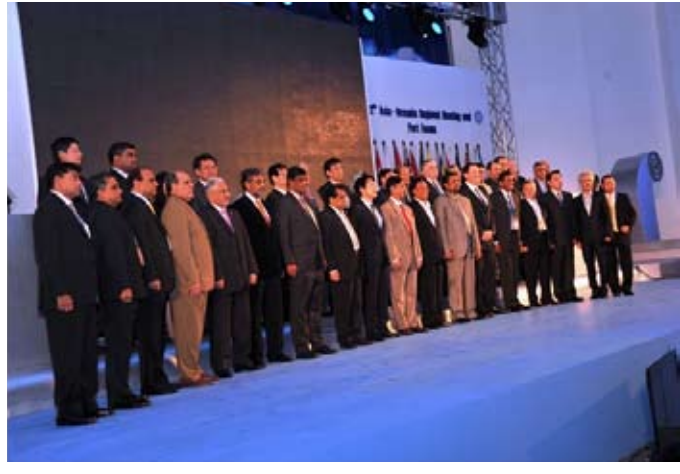
Delegates from the International Maritime Community at the 12th IAPH Forum meeting in Sri Lanka.

The CEO made these observations as a part of his address, "Fiji Ports – Maximising the operations across the four major ports in Fiji", made to the Australasian Ports and Harbors Congress 2012. This was the first time