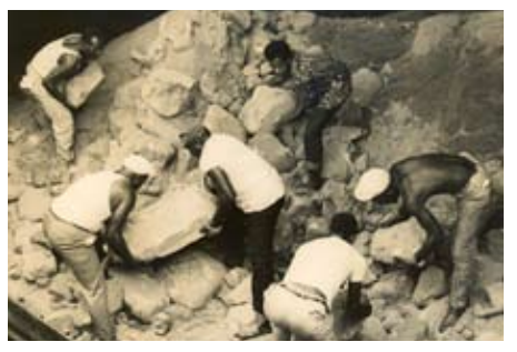
Stevedores worked in the ship's hold to trim the sugar.

carts into nets in loads of about two tons at a time, before being slung on board and unloaded onto grilles above the ship's open hatch. The sacks were then split open, and the contents emptied into the hold, where gangs of workers worked