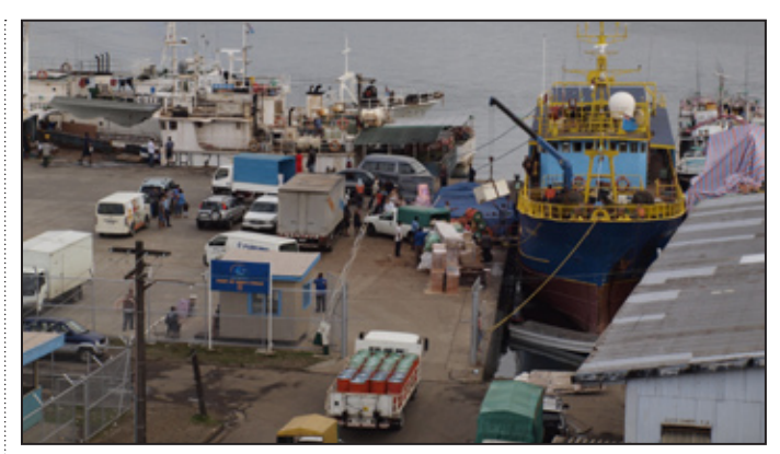
Muaiwalu wharf sees increased activity as the holiday season begins.

With the Lomaiviti II now including Tuvalu in its itinerary, there is an increase of capacity at the wharf. But