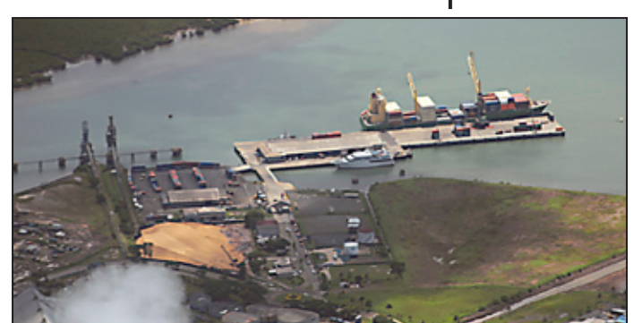
The AMEX construction will take place on the triangular-shaped land, to the right of the photograph.

THE construction date of the AMEX Resources Ltd loading port has been extended until February 2014.