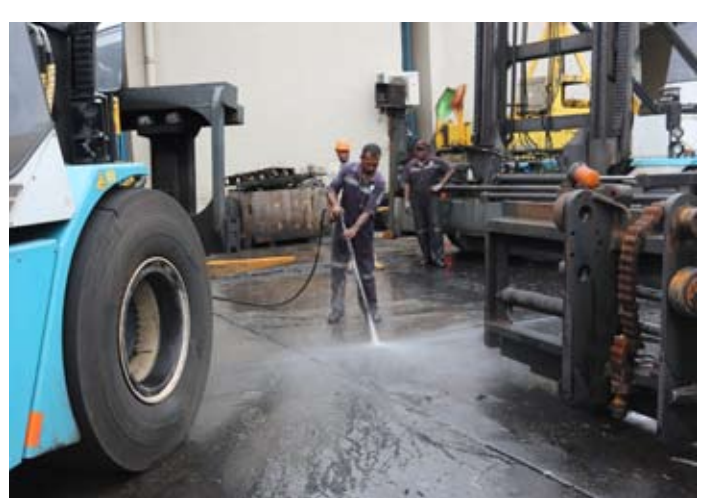
Water blasting to clean the wharf surface at the Port of Suva.