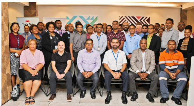
Attendees at the NIIPP Workshop.

Fiji Ports participated in the National Infrastructure Investment Plan planning workshop, organised by the Ministry of Economy, on 17th August 2022 at the Tanoa Plaza Hotel in Suva. The Fijian Government, through technical assistance from the Pacific Region Infrastructure Facility (PRIF) will be developing and formulating a National Infrastructure Investment Plan (NIIP) which will support the strengthening of Fiji's infrastructure planning processes, procedures, and methodologies. The NIIP will examine the infrastructure needs of all sectors of the nation, drawing on the existing hierarchy of National Development Plan (NDP) objectives, and sectoral and institutional level plans.