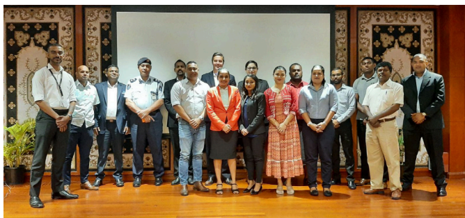
LTA Steering committee members.

Fiji Ports, amongst other key stakeholders were invited by the Land Transport Authority (LTA) to be part of the steering committee with the objective of improving operation of passenger