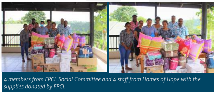
4 members from FPCL Social Committee and 4 staff from Homes of Hope with the supplies donated by FPCL

A few of the FPCL staff had met with the wonderful young ladies and the staff in the care facility and they bestowed their words of thanks to the kind donations made by the Fiji Ports Corporations Limited. FPCL donated a total $2447.47 worth of supplies as in blankets, pillows, stationaries, bed sheets, toiletries and more to the Hopes of Home foundation.