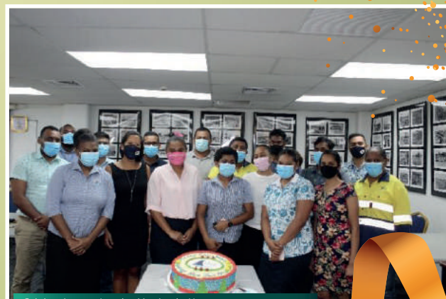
Celebrations at Level 2 Muaiwalu House FPCL HQ for a successful 2021

By the end of the year as FPCL began to wrap up their work for the year and celebrate all their achievements, and one being for Fiji Ports is winning World Cruise Awards for the award of 'Oceania's Best Cruise Terminal 2021.'