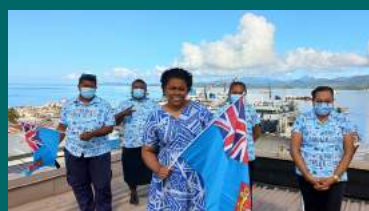
3rd Place: Infrastructure and Planning