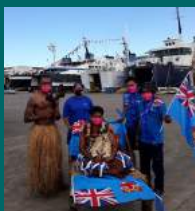
1st Place: Local Wharf Suva Team.

Congratulations to the winners in the FPCL Fiji Day Best Outfit contest. It was a hard choice and in the end 3 winners were chosen. Lots of creativity and effort was displayed.