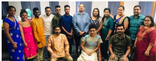
Finance Division with ICT and MLBS at level 4

Diwali is a festival of new beginnings and the triumph of good over evil and light over darkness. This special occasion was held at FPCL as many FPCL staff celebrated by dressing up in Diwali attire whilst they enjoyed the feast of delicious Diwali delights. Small sweet boxes were distributed to all staff.