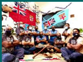
2nd Place: Engineering Department Lautoka