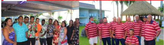
FPCL Department teams at the Christmas Party

FIJI PORTS CORPORATION LIMITED ANNUAL CHRISTMAS PARTY