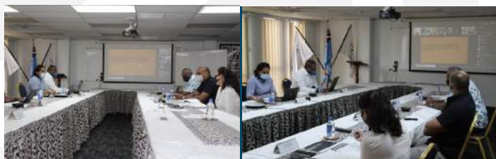
FPCL staff attending "Climate and Natural Hazard Risk Assessment" workshop by GHD Group Pty Ltd at Mua-i-Walu House Level 2, Suva

The team of GHD conducted a workshop to facilitate discussions on and completion of a Climate and Natural Hazard Risk Assessment tool. FPCL participated in this workshop due to expertise in the areas of port operations, maintenance, safety and strategic planning for Suva and Lautoka Ports, as FPCL's insight and experience would be invaluable to the completion of the Risk Assessment.