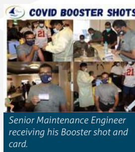
Senior Maintenance Engineer receiving his Booster shot and card.

The Ministry of Health has begun administering booster shots to the public to ensure that people receive the full protection against the COVID-19 virus, especially for those who are our front liners, and those who will be at the highest risk of exposure to the virus. Booster shots and registrations were administered by the Ministry of Health and the Officers of RFMF to Staffs of FPCL, FPTL and Fiji Ships at the Tourist Lounge at the Port of Suva.