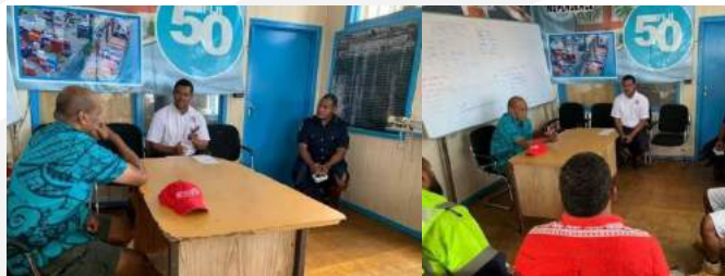
Minister Usamate briefed by government officials led by Lomaiviti Provincial Administrator, Asesela Biutiviti

The Minister for Infrastructure, Meteorological Services, Lands & Mineral Resources, Hon. Mr. Jone Usamate toured infrastructure projects on the island of Ovalau and rural water project on the island of Moturiki. This makes Minister Usamate to be the first Minister to visit the two islands since the opening of COVID-19 lockdown borders. The Minister was briefed by the Government officials led by the Lomaiviti Provincial Administrator, Asesela Biutiviti. Mr Biutiviti highlighted the major infrastructure works on the island of Ovalau and the COVID-19 works and vaccination update on the island.