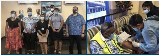
FPCL volunteer staffs for the blood test.

Ministry of Health and Medical Services with support from Australian Government and Fiji National University undertook a study on our frontliners before opening of borders along with sample blood tests taken. This survey is very important for the opening of our international borders as it will give the Ministry information the level of protection in the community especially in our frontline workers. Project Title: "Rapid seroepidemiological estimate of SARS-CoV2 prevalence in populations at higher risk of transmission during the opening of international borders in Fiji". Eight staff volunteered; 5 Takei's (2 Male & 3 female) and 3 Indo Fijians (1 male & 2 females).