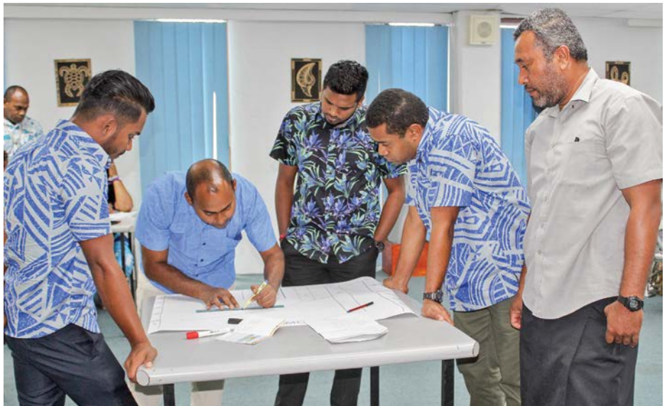
Working together to find solutions.

Junior staff are encouraged to contribute solutions as Quality Circles encourage a bottom-up approach to finding solutions, and all ideas are accepted as good ideas.