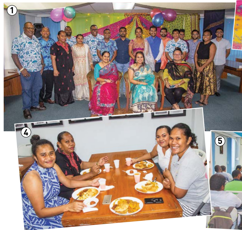
1. A happy group. 2. Best dressed winners. 3 & 4. Enjoying Diwali delights. 5. CEO's Diwali message to staff.