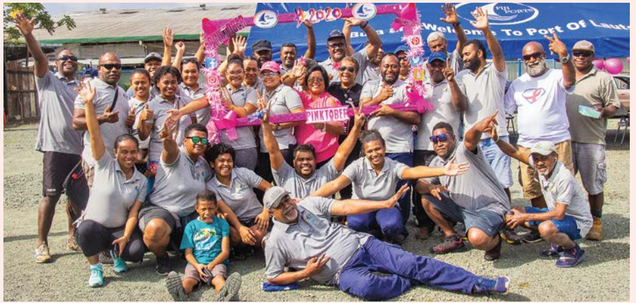
The FPCL team shows support for Pinktober.

This year, on 31st October, FPCL staff and their families met in the early morning at 6.00 a.m. After a warm-up and stretching session, the participants walked from Ratu Sukuna Park, Suva city to the Mua-i-Walu parking lot, in Matua Street, Walu Bay, accompanied by an ambulance, in case of any unforeseen medical emergencies.