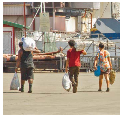
Passengers prepare to board an inter-island vessel.

Stakeholders and the general public are cooperating with the need for timely cargo and passenger drop-offs and pick-ups. These are being managed smoothly and without congestion. During the festive season, except for Christmas Day, Mua-i-Walu II Wharf will continue to be open daily, from 0600 hours until 2200 hours.