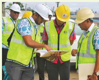
Discussing the details during the inspection.

They also manifest as action, as demonstrated by the recent inspection of FPCL and FSHIL facilities and infrastructure, conducted by the FPCL Board Chairman, FPCL Executive Management and FPCL and FSHIL Senior Managers, as on site inspections are key to informed decision making and forward planning.