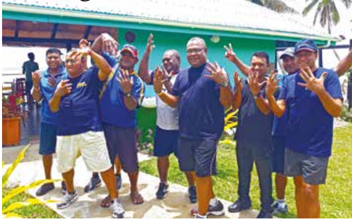
{\it CEO with rest of our male staff show off their painted nails as part of the team bonding exercise}

team bonding exercise for the staff of FPCL was held at the Crusoe Retreat in Serua from November to December.